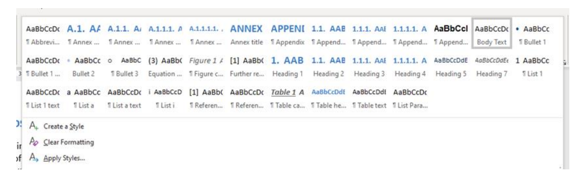
Figure 2 The Styles Gallery

To maintain a set of professional and consistent documents, it is essential that authors are familiar with the concept and use of Microsoft Word styles. These are pre-defined text styles that have customized formatting for appearance and functionality. The document styles available to authors are displayed in alphabetical order in the Style Gallery displayed on the Home tab of the Word ribbon and shown in Figure 2: