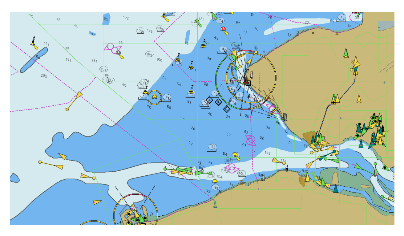
Figure 2 Display of AIS