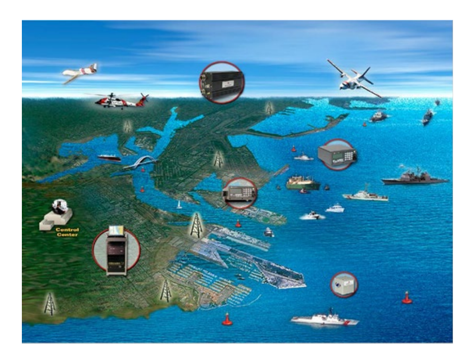
Figure 3 Representation of some types of AIS Stations

An indication of the data broadcast by each AIS station is provided in annex C.