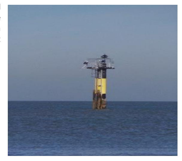
Figure 4 Example of offset placed figure

Figures should be centred with wrapping In Line with Text and labelled using the Figure caption (or Annex Figure caption) style centred below the figures. Alternatively, figures can be offset with text wrapping so that the text does not overlap the figure but arranges the paragraph such that it continues onto the next line in an appropriately sized paragraph.