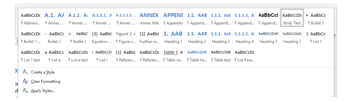
Figure 2 The Styles Gallery

In order to maintain a set of professional and consistent documents it is essential that authors are familiar with the concept and use of Microsoft Word Styles. These are pre-defined text styles that have customized formatting for appearance and functionality. The document styles available to authors are displayed in alphabetical order in the Style Gallery displayed on the Home tab of the Word ribbon and shown in Figure 2: