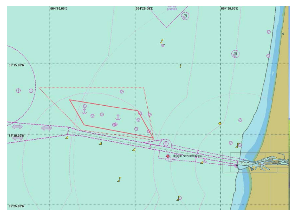
Figure 8-2 The anchorage area off IJmuiden with an enlarged area

The average number of ships for is given for both areas. The average density is the average number of ships divided by the surface. Be aware that the average density for the common area, thus the official anchorage area, is the sum of both densities.